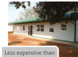
Less expensive than bricks & mortar