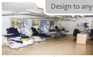
Design to any floor plan