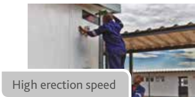
High erection speed