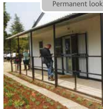
Permanent look & feel