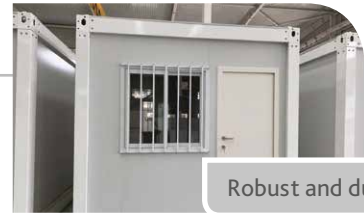
Robust and durable