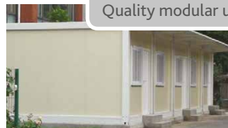
Quality modular units