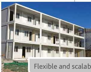
Flexible and scalable